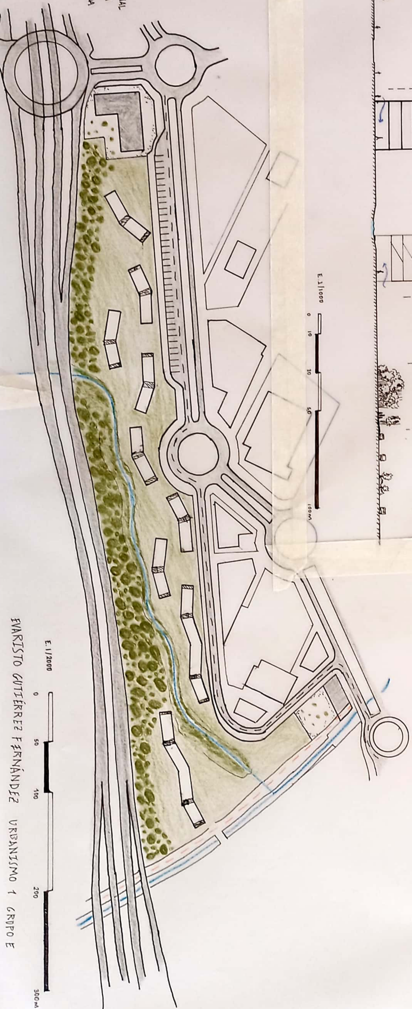
E. 1:2000 0 50 100 200 300 M