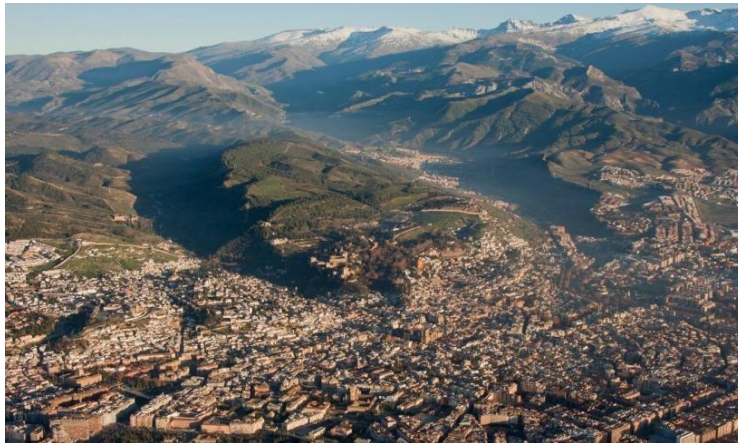
Aerial photo of the geographical environment of the city.

The Darro River Valley is one of the most unique geographical areas of the town, being the beginning of a historical river route towards Guadix and the Iberian southeast. It is currently in the process of being declared a Cultural Interest Asset (BIC) and it is a crucial moment to think about its present and future values.